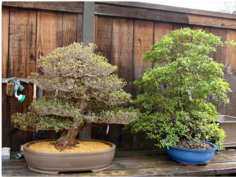
Freshly repotted satsuki from our repotting workshop in 2013. Aren't they gorgeous?!

This Month's Meeting: Thursday February 26, 7:00 - 9:30, Lake Merritt Garden Center, Oakland