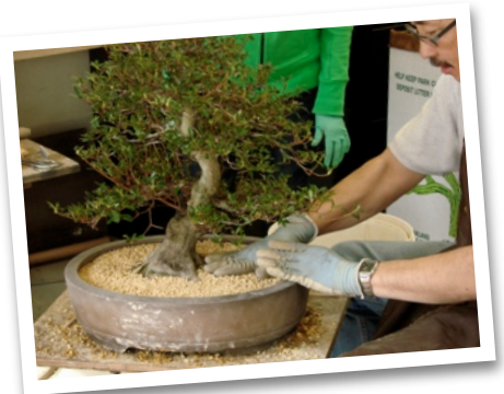
Carefully settling the soil around the roots is a critical step in successful repotting of satsuki

PLEASE RSVP TO DARREN OR CANDACE IF YOU WILL ATTEND THE REPOTTING WORKSHOP