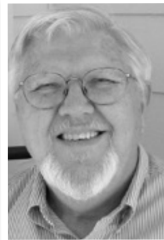
Who wouldn't love to have this friendly guy on their Board?