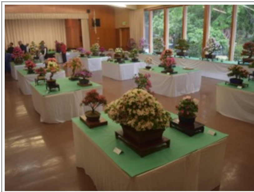
What a gorgeous display!

This Month's Meeting: Thursday November 17 6:30 - 9:30, Lake Merritt Garden Center, Oakland