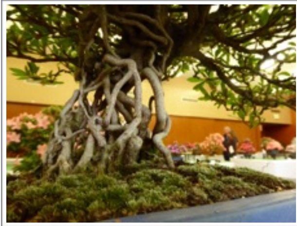
Ant's eye view of the Azalea show.

Anyone inspired to bring refreshments for our meeting is encouraged to do so. Treats are always well appreciated.