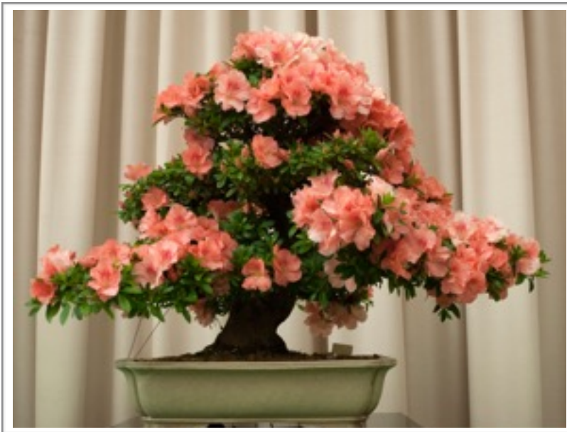
Darren Wong's Wakaebisu at the Spring show.

Thursday October 20, 7:30 - 9:30, Lake Merritt Garden Center, Oakland