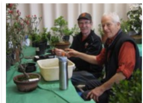
These happy guys got a jump on their Ward's Ruby styling last Spring at the show. How's yours looking?

Remember the Ward's Ruby Challenge? As a refresher, this is the way it works: the trees many of you have fostered since the Spring should now be styled to your taste and whims. It is time for the moment of truth, voting for the best one. The winner gets to keep his/her tree and wins free club membership for 2018. The rest of the trees will be sold at the show this year or can be purchased at the meeting.