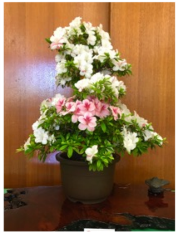
A beauty from Ray Moore

Great photos . . . of Japanese azalea gardens are on view at Jonas Dupuich great website bonsaitonight.com . Amazing to see such spectacular trees in all stages of development. Check it out!