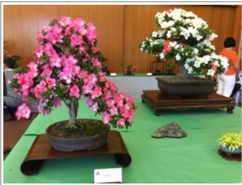
It truly was "all about the Flowers" at this year's Spring Show

This month's meeting: Thursday June 22, 7:30-9:30 pm Lake Merritt Garden Center, Oakland