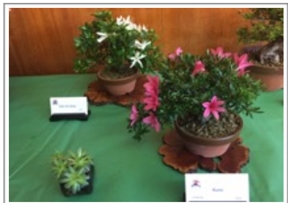
A few of the "Trees in Training" on display