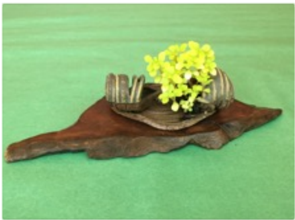
The accent plants were amazing too