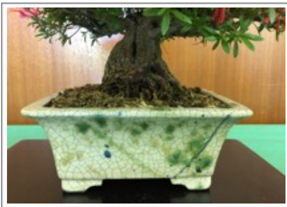
One of the great pots at the Show