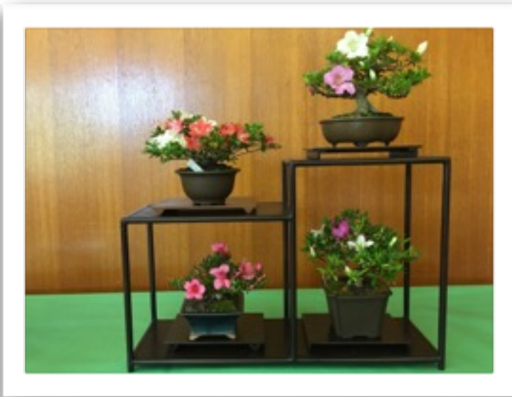
Shohin display at the 2017 Show